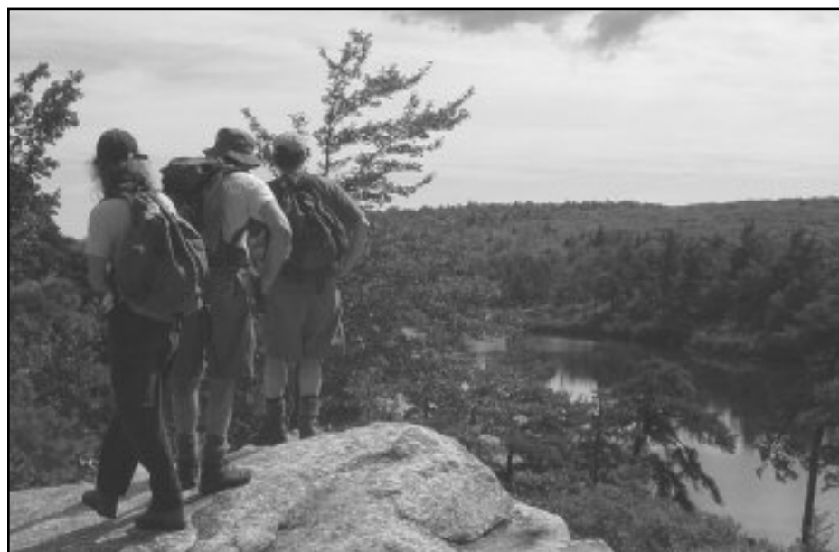
Choose from among 94 hikes, 70 workshops, and a host of other activities.

Unless otherwise noted, the registration fee covers the cost of all hikes, workshops, and meetings. Excursions, transportation to/from hikes, and the featured Saturday night entertainment require additional fees. Membership in the Appalachian Trail Conservancy, the New York-New Jersey Trail Conference, or any AT maintaining club is not required. All are welcome.