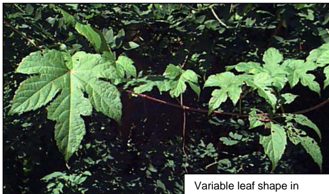
Variable leaf shape in porcelainberry. (Grape leaves are also very variable).