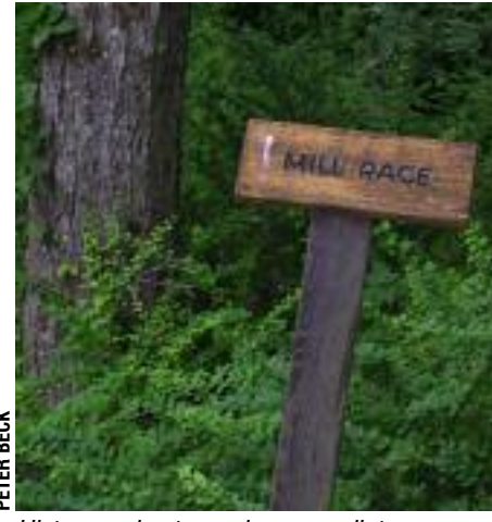
History and nature mix on a walk to Coventry Pond. Top: Garris Mill.

The beginning of the Coventry Pond Trail parallels VanCampens Brook, which is a clear, fast-running trout stream with several rapids and falls; very photographic. The trail follows the course of a dirt road built in the 1960s as part of the land preparation to build a house by George J. Busch, who also owned the Watergate Recreation Area. A few hundred feet after the gate, another old road heads off to your right; this is the driveway to an old home site and dead ends.