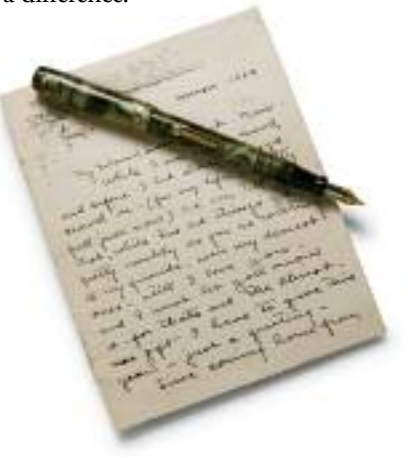
Please send your letters to: Governor Jon Corzine PO Box 001 Trenton, NJ 08625

Ideally, all trail maintainers in New Jersey and hundreds of hikers would send letters. If we are to get ATVs back on the "radar screen," we need you to be one of those writers. Your letter will definitely make a difference!