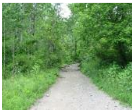
The Shawangunk Ridge Trail follows this now protected rail trail.

Years ago, the northern end of the land was used as a sand and gravel quarry, and there are still remnants of some of the old cement footings and walls. The property has since reverted to a more natural environment.